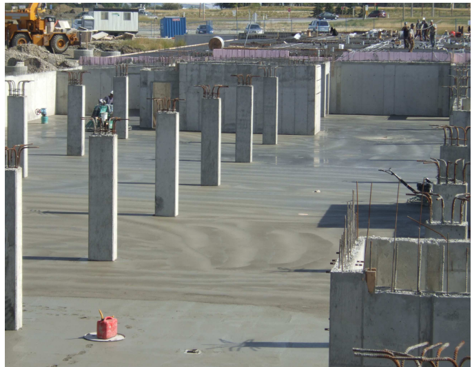
Concrete floors deliver high performance at reasonable cost

Are your floors working for you? Let us show you what is possible. Don't hold back because you think your budget cannot get you the performance you need. We work with your design pro-